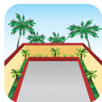
TERRACE GARDEN/ PODIUM

The information indicated here is true to the best of our knowledge. However no warranty/guaranty is implied on our products as the conditions of use and the skill and quality of manpower used for installation is beyond our control.