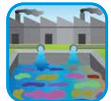
INDUSTRIAL WASTE PITS

The information indicated here is true to the best of our knowledge. However no warranty/guaranty is implied on our products as the conditions of use and the skill and quality of manpower used for installation is beyond our control.